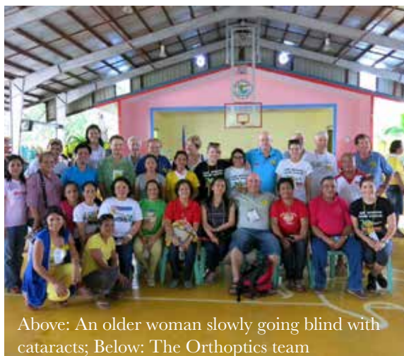
Above: An older woman slowly going blind with cataracts; Below: The Orthoptics team

Canterbury allows the students involved to not only put their studies into practise